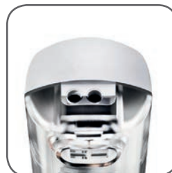
Cage Clamp or Wieland connector